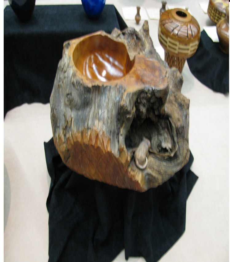
REMEMBER TO KEEP YOU TOOLS IN GOOD SHAPE AND SHARP. SHARP TOOLS MAKE FOR SAFE AND BETTER TURNING.