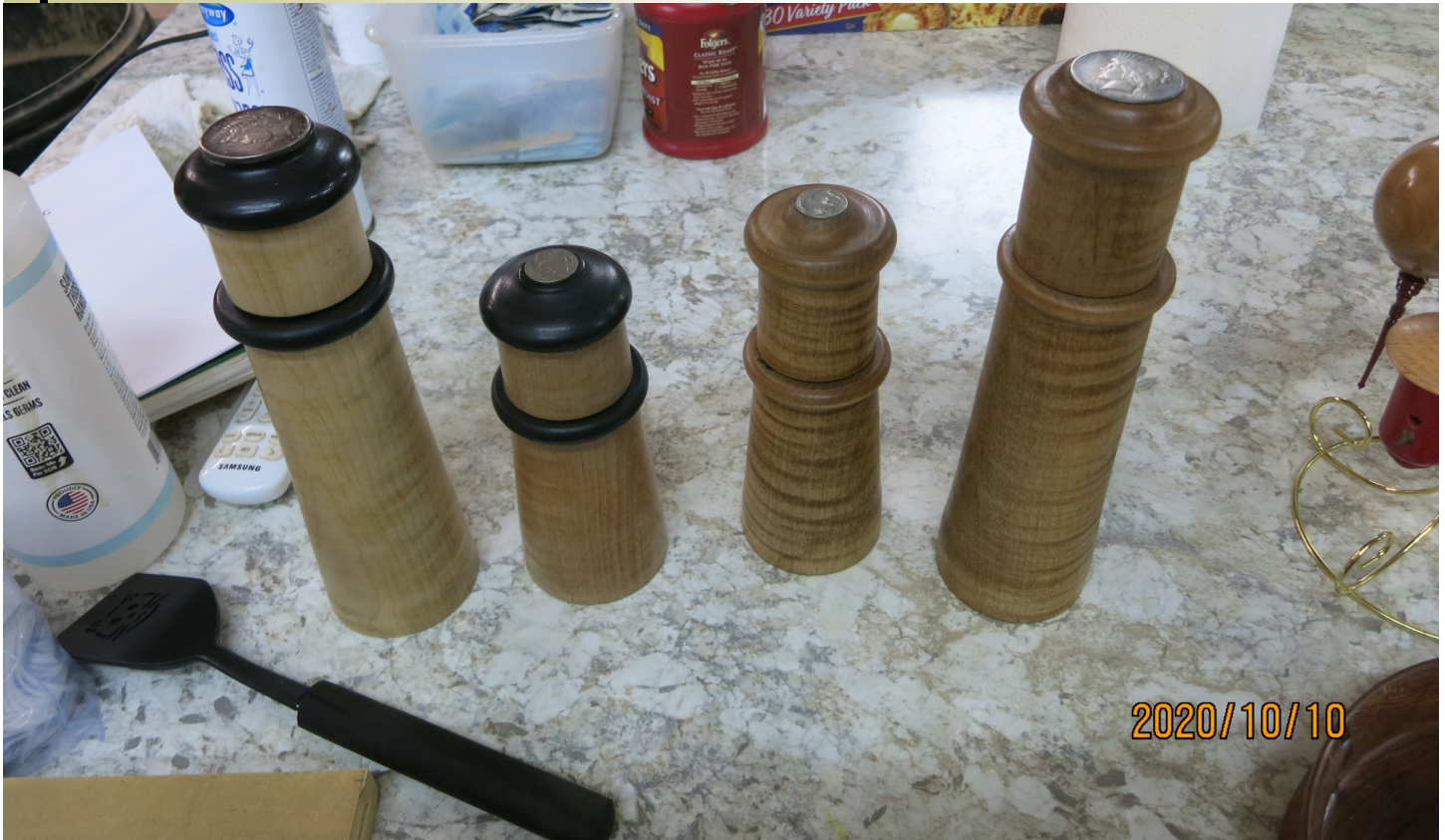
Show and Tell Items from the Last Meeting.