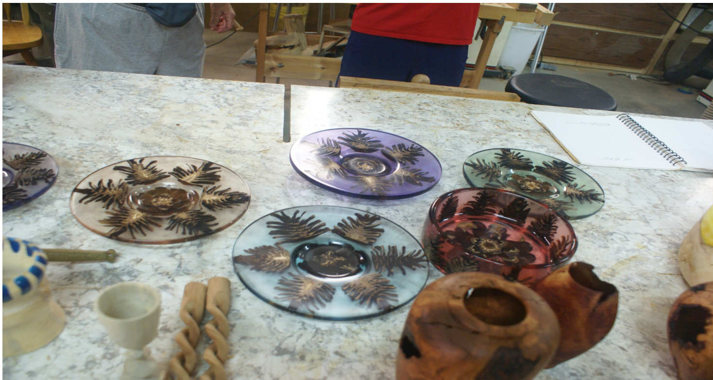
Jimmy's Pine Cone Platters: See how it's done at the Demo.

Some of last month's show and tell items.