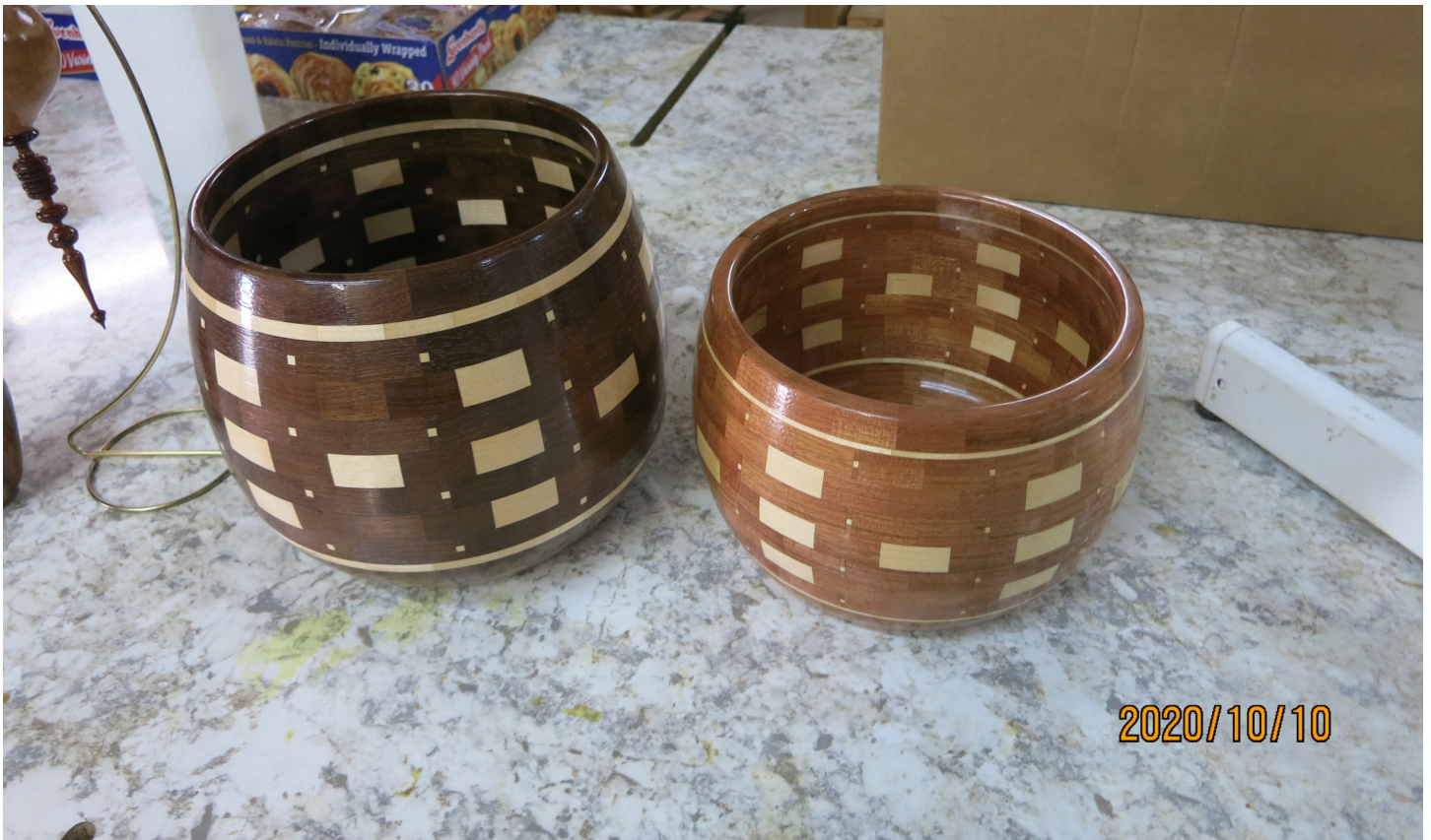
Show and Tell Items from the Last Meeting