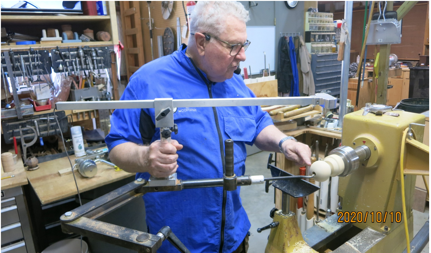
Hollowing a Christmas Ornament using the Ron Brown Handheld Laser System. Low end to High End equipment . Both work well.