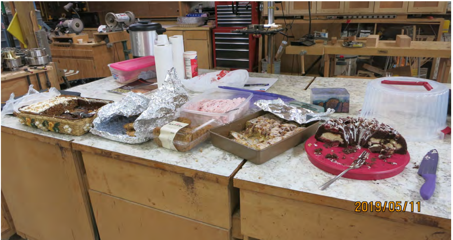
Dessert's provided by members at the last meeting.