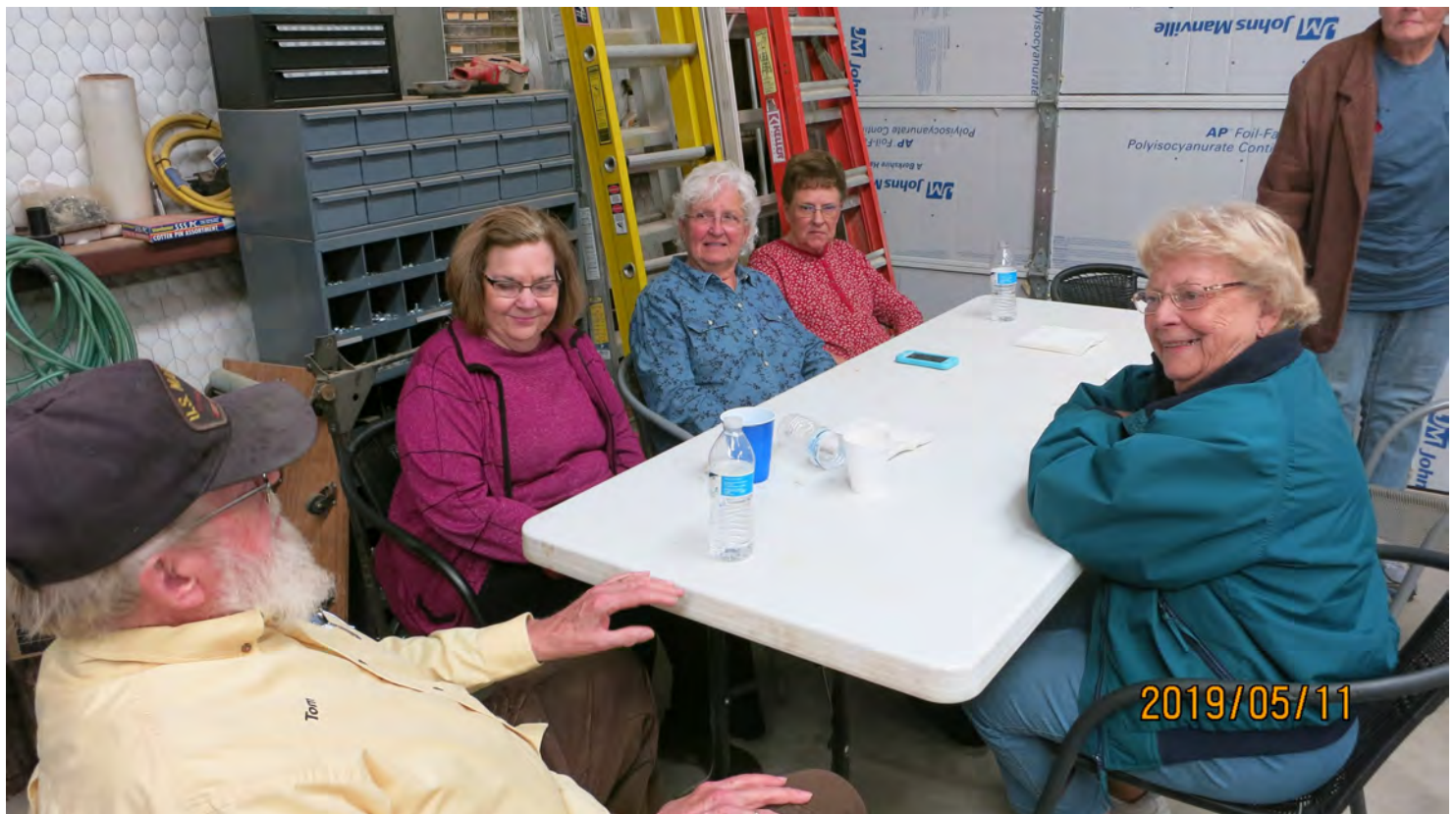
A lot of visiting after the last meeting. It's just as important as the turning (in my opinion).

Keep your tools sharp and the chips flying.