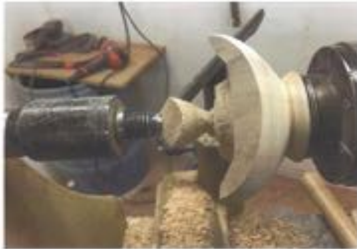
4. Hollowing out, bowl mounted in chuck.