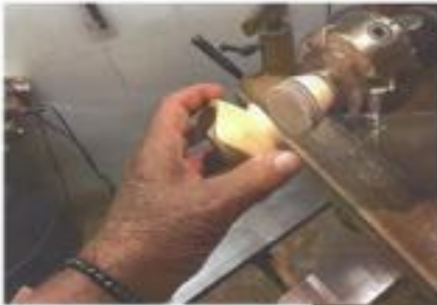
5. Sanding bottom of bowl.